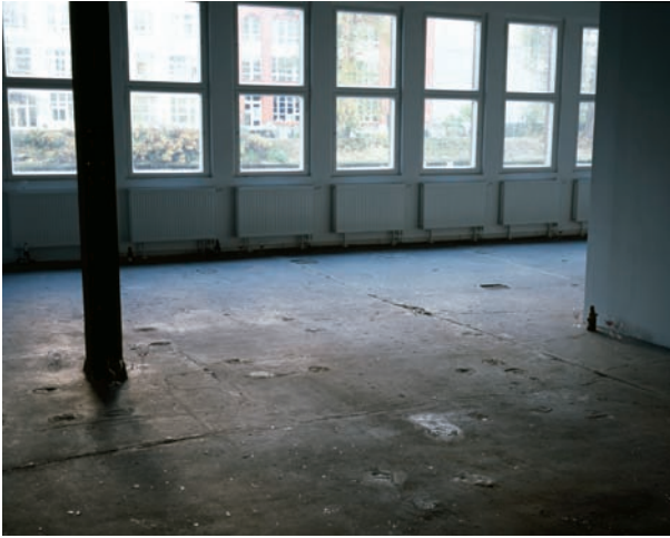
The Glass Track , 2005 (installation view, BüroFriedrich, Berlin), sound installation, 10 min loop